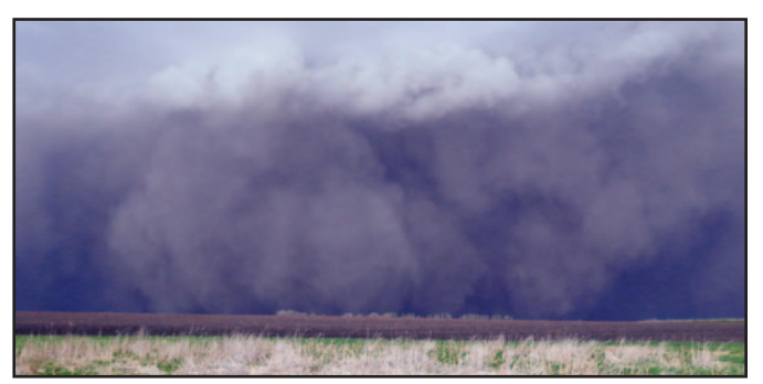
The awesome power of the Creator's weather events caused great tree damage, but even that turned out to be a blessing that worked for good.

The word of God speaks of a second resurrection after the thousand years have passed. "Then I saw a great white throne and Him who sat on it, from