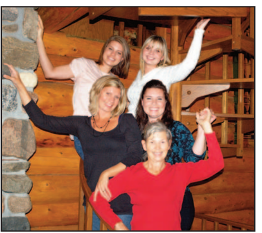
Joy in living is a product of the spirit of God placed within the hearts and minds of His elect, making all things work together for good.

"In this you greatly rejoice, though now for a little while, if need be, you have been