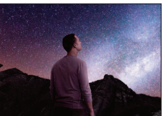
We are oftentimes perplexed as to why things happen to us the way they do. However, there is great purpose in everything that happens to us.

purpose = prothesis, "a setting forth or proposal."