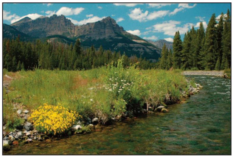
We see the beauty and character of the invisible God every time we gaze at the mountains, trees, flowers, streams, animals, birds, and the human body, for these creations reveal the character of the Great Maker.

3. In spite of severe trials that God may give us, all things work for the best. Our heavenly Father is in total control of our lives. He knows exactly what