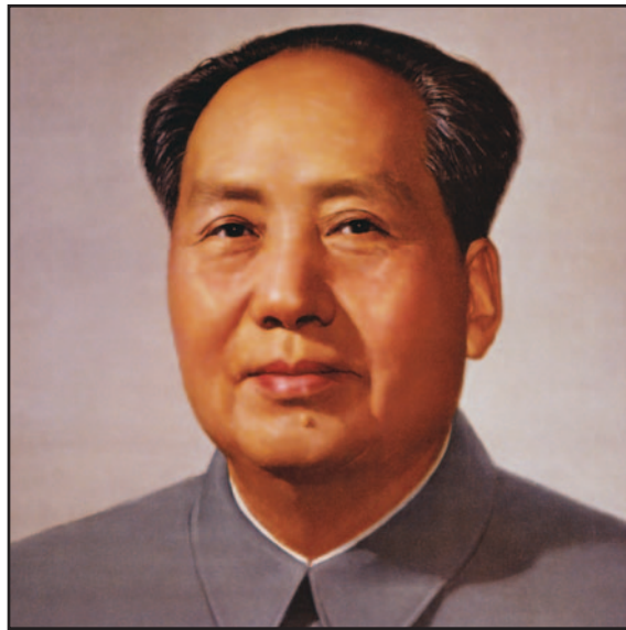
Mao Tse Tung, the Communist dictator of China, was one of the most ruthless totalitarian leaders of all time. Would God's people be obligated to obey all of his commands?

"Now the works of the flesh are evident, which are adultery, fornication, uncleanness, lewdness, idolatry, sorcery, hatred, contentions, jealousies, outbursts of wrath, selfish ambitions, dissensions, heresies,