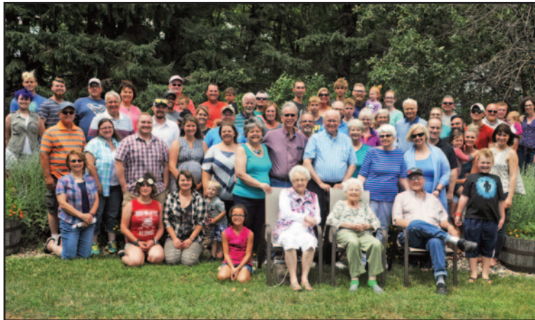
Big families are the joy of the members, as well as the Creator who makes them all, for He declared, "Be fruitful and multiply, and replenish the earth."

"So God created man in His own image; in the image of God He created him; male and female He created them. Then God blessed them, and God said to them, 'Be fruitful and multiply; fill the earth and subdue it; have dominion over the fish of the sea, over the birds of the air, and over every living thing that moves on the earth'" (Genesis 1:27-28).