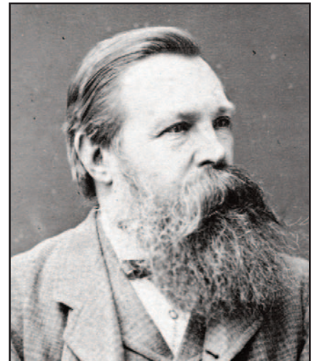
Frederick Engels, the funder of Karl Marx during his writings on Communism.