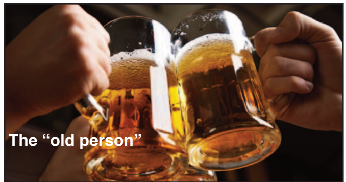
The “old person”