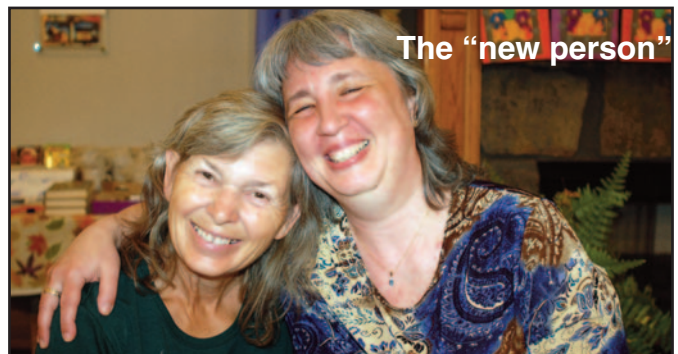
The “new person”