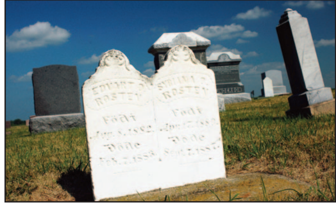
The people buried in cemeteries, or anywhere on the earth or lost in the sea, are existing in a state of "sleep," from which they wil some day be raised in a resurrection.

Several other scriptures could be given which