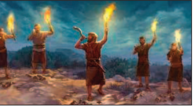
The army of Gideon was pared down from 22,000 to only 300 to make it clear that the battle against Midian would be won through God's power, not by man's.

God's command to us to "fear not" is stated frequently throughout Scripture, such as in Genesis 21:17; 26:24; 46:3; Exodus 20:20; Numbers 14:9; 21:34; Deuteronomy 1:21; 3:2 ,22; 31:6, 8; Joshua 10:8; Judges 6:10, 23; Ruth 3:11; I Samuel 12:20; I Chronicles 22:13; 28:20; II Chronicles 20:17; Psalm 27:3; 46:2; 56:4; 118:6; Isaiah 35:4; 41:10, 13, 14; 43:1, 5; 44:2, 8; 51:7; 54:4, 14; Jeremiah 30:10; 46:27, 28; Lamentations 3:57; Daniel 10:12, 19; Zephaniah 3:16; Haggi 2:5; Zechariah 8:13, 15; Mat-