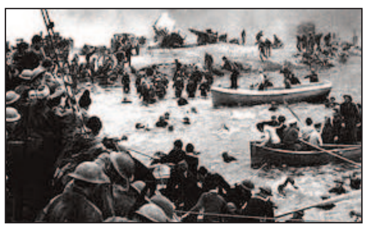
Over 300,000 English and Allied soldiers were ferried by boats of all sizes from Dunkirk to England while the Germans were hindered at every turn.

Meanwhile, word was spreading across England of the need for boats to cross the channel to Dunkirk,