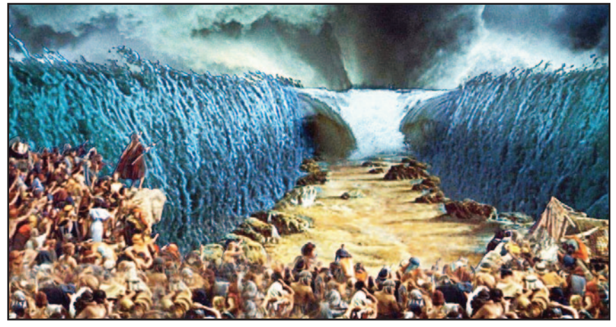
Israel was delivered out of Egypt — a type of sin — through the mighty power of God's hand by causing Israel to be "baptized under the cloud," as it were. God fought the battle for them!

[See also Isaiah 31:1-2; Psalm 3:1-8; 147:10-10; Proverbs 18:10; 21:31; I Samuel 14:6; II Chronicles 14:8-12.]