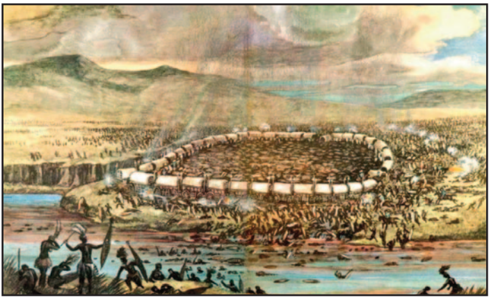
According to reports, a supernatural white cloud hovered over the laager of the Boers all day during the Battle of Blood River. Not one Boer was killed.

for what purpose no one was exactly sure. Almost any vessel would do: rowboats, fishing trawlers, tugs, motorboats, any boat. Many of the craft lacked compasses. None of them were armed.