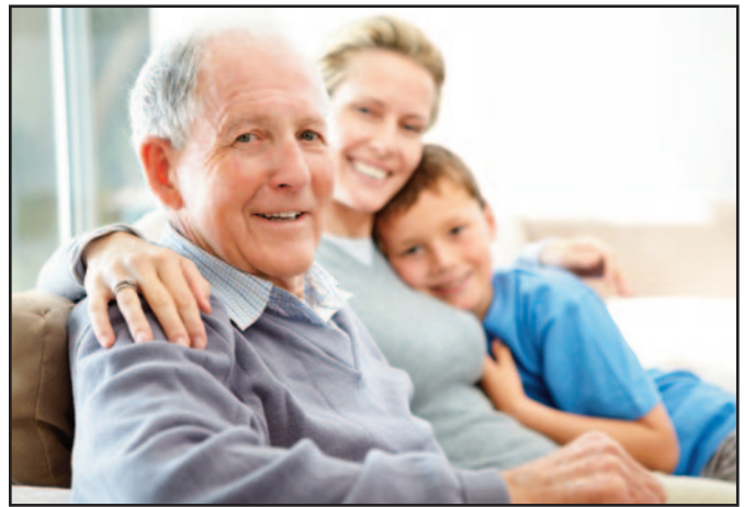
Children must honor their parents, which is only sensible; they gave them life in the first place.

Even hating your brother is akin to killing him, so God's people will be known by their attitude towards those who might give a person every reason to hate them ... according to the world's standards. Notice what Jesus Christ said in Matthew 5:38-48.