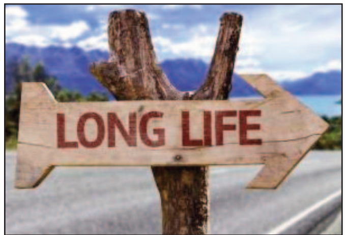
The promise for keeping the Fifth Commandment: long life, and an abundant one as well.

"You have heard it said, 'An eye for an eye and a tooth for a tooth.' But I tell you not to resist an evil person. But whoever slaps you on your right cheek, turn the other to him also. If anyone wants to sue you and take away your tunic, let him have your cloak also. And whoever compels you to go one mile, go with him two. Give to him who asks you and from him who wants to borrow from you do not turn away. You have heard that it was said, 'You shall love your neighbor and hate your enemy.' But I say to you, love your enemies, bless those who curse you, do good to those who hate you, and pray for those who spitefully use you and persecute you, that you may be sons of your Father in heaven; for He makes His sun rise on the evil and on the good, and