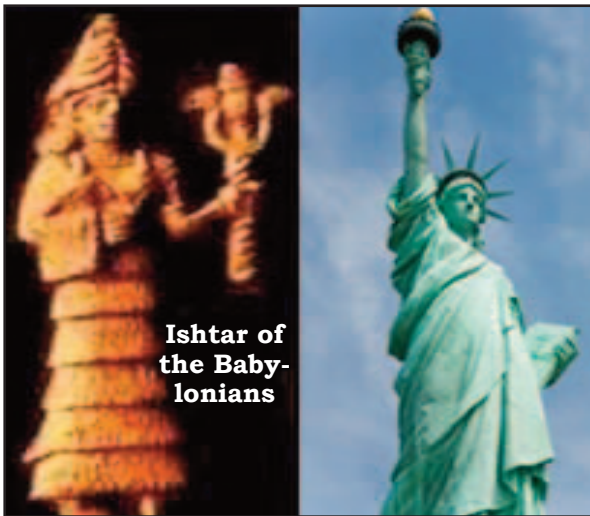
Ishtar of the Baby- lonians

This, in a sense, a major symbol of our own land invites all people to engage in the free-wheeling “liberty” of the fertility goddess to indulge in whatever pleases the senses ... which is indeed what our culture has come to embrace more and more. The words of the apostle Paul ring as true today as they did nearly 2,000 years ago,