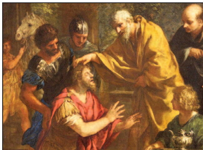
Ananias prayed and asked God to remove the blindness of Paul, and quickly that blindness was removed.

The angel led Peter out through the gate, which opened on its own accord, and he joined some brethren in a house nearby. Those prayers literally