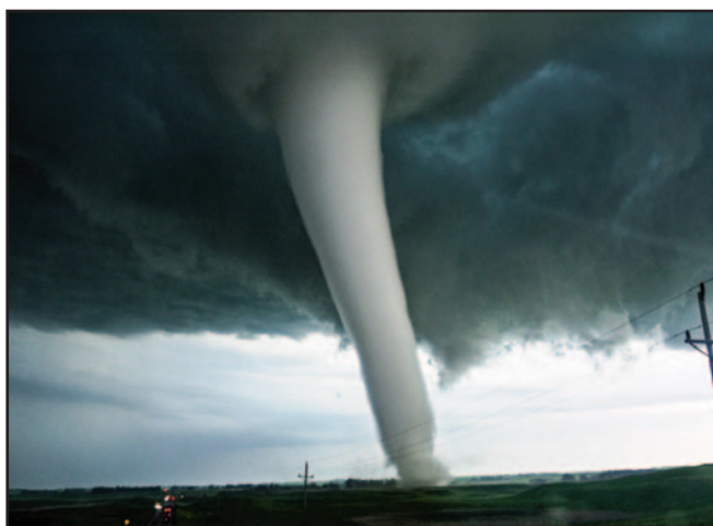
Even tornadoes, hurricanes, and rainstorms can be formed or turned away by the mighty power of the Eternal.

Then Yahweh set ambushes against the armies of Ammon, Moab, and Seir, and those armies were defeated. The Ammonite and Moabite armies consequently destroyed the army of Seir, and finally turned upon each other. All of the enemy was destroyed!