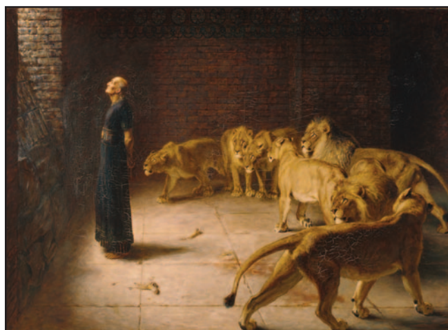
The prayers of the elect have a powerful effect, even taming wild beasts as Daniel experienced in ancient Persia.