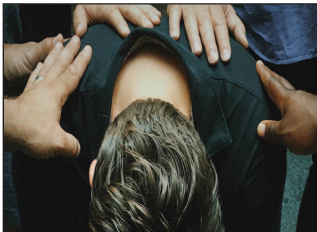
Praying for the sick by the laying on of hands of the elders is a pathway to healing.

“Thus says the Lord God to you: ‘Do not be afraid nor dismayed because of this great multitude, for the battle is not yours, but God’s’” (verse 15).