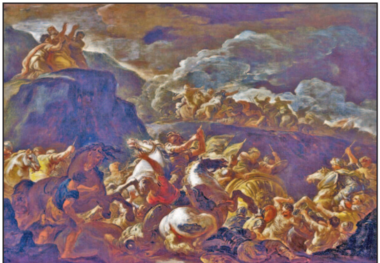
Israel battled the Amalekites, as the Eternal intervened in favor of Israel through lifting up hands in prayer, not because Israel was more powerful.

1. Prayer can literally change the outcome of battles. As Solomon said, “The race is not to the swift, nor the battle to the strong” (Ecclesiastes 9:11). It is God who determines the victor in a contest, be it in military campaigns, in political contests, or in court cases. In Exodus 17:8-13 we read how Israel battled Amalek, and Moses walked to a hilltop to plead with Yahweh for Israel’s deliverance. When Moses’ hands were raised Israel prevailed, but in time he dropped his arms in exhaustion. Thereupon