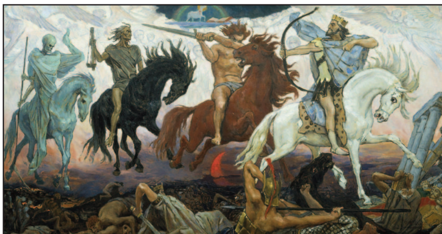
The four horsemen of the apocalypse, Trumpets 1, 2, 3, and 4, picture the destructive power of the Adversary working through mankind to pour out war and suffering on mankind.