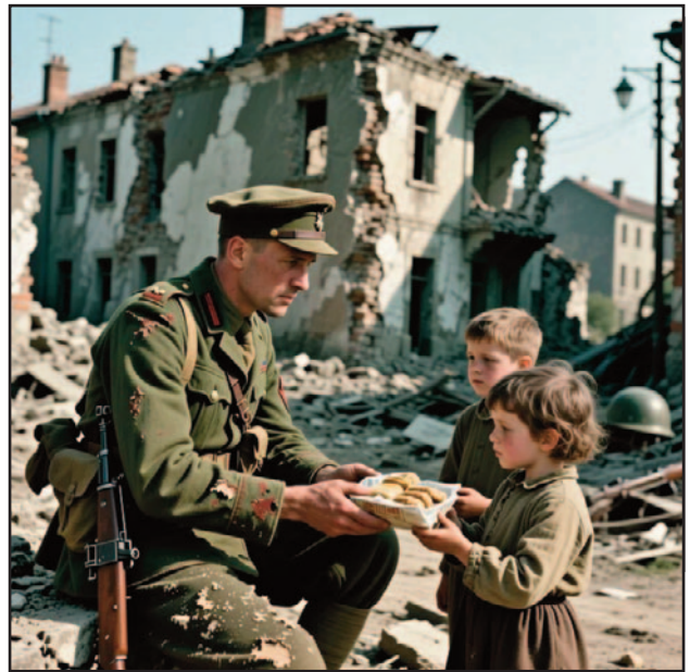
The tragedy of war strikes children perhaps harder than anyone, leaving scars for life.

6. Political upheaval. The object of war is to conquer a perceived enemy through destruction or weakening of the opposing army so the opposition will either capitulate or cease to exist. Usually the defeated state has a change in leadership, or the land is absorbed into the victorious nation.