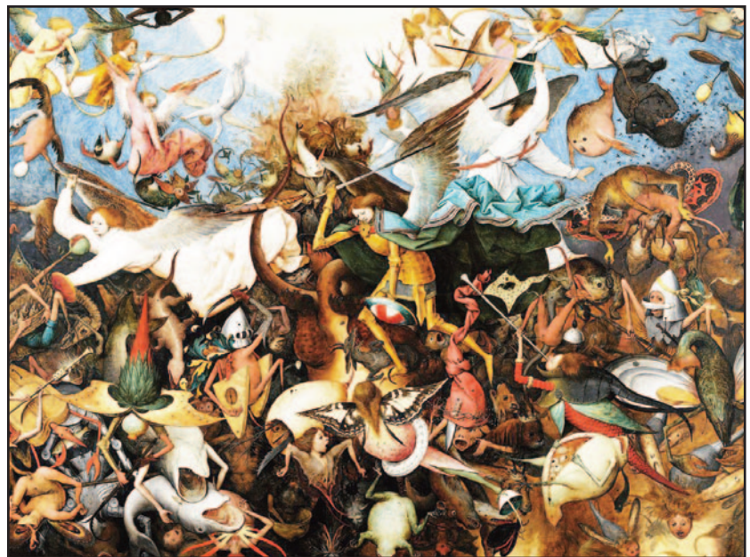
The artist Pieter Bruegel attempted to illustrate war in heaven (1562), but we can be assured that such fighting would be far beyond our imagination to comprehend.

“And war broke out in heaven: Michael and his angels [ aggelos , ‘a messenger’] fought with the